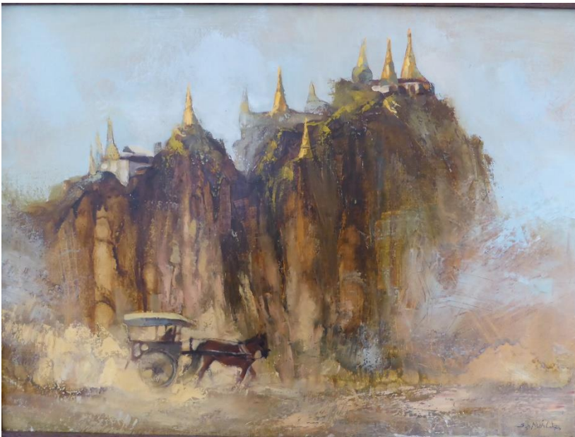
The pilgrim by Arthur Sun Myint 1976, oil on canvas. 8" X 24"